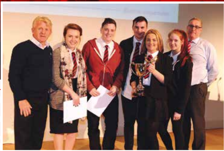
Gordon Strachan presents the Brookfield Cup to the winning Govan High School team