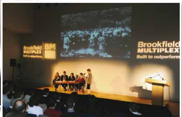
The team perform in The Burrell Collection Lecture Theatre

The judging panel, chaired by Scotland national team manager Gordon Strachan, obviously appreciated the effort that Govan High had put in and the verdict was unanimous: outright winners Govan High School for the second year in a row.