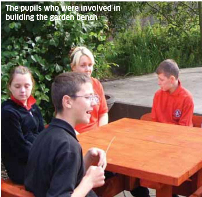
The pupils who were involved in building the garden bench

'OUR FOURTH AND FIFTH YEAR LEAVERS HAVE RECEIVED ADDITIONAL ADVICE FROM CAREERS ADVISERS FROM CAREERS SCOTLAND'