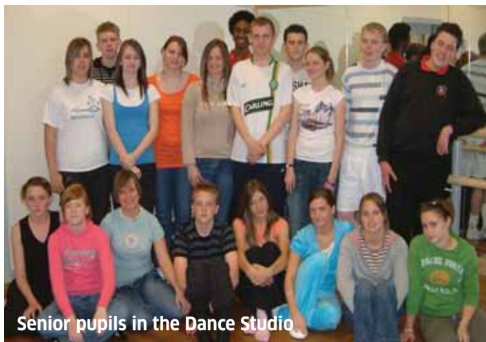
Senior pupils in the Dance Studio

'FUNDING FROM THE PROGRAMME HAS BEEN USED TO SUPPORT OUR SENIOR AND JUNIOR DANCE GROUPS'