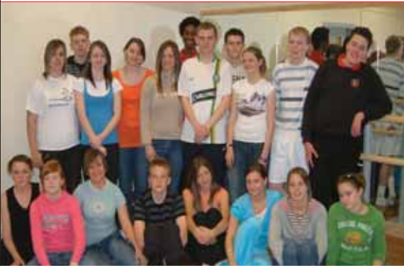
New Dance Studio - page 02