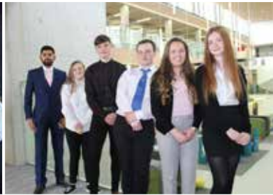
Career Ready Programme