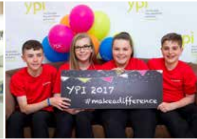
Youth & Philanthropy