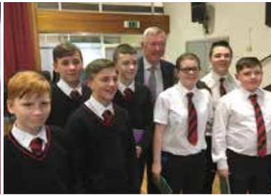
Sir Alex Ferguson Visit