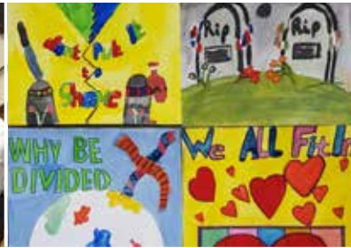
Sense over Sectarianism