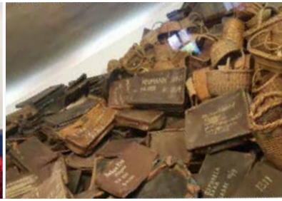
Poland History Trip