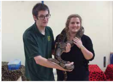
Animal Man Visit