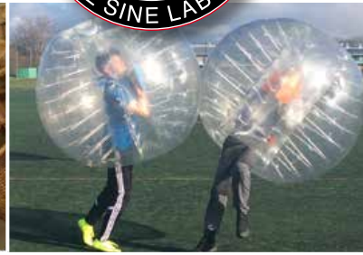
Bubble Football Fun!