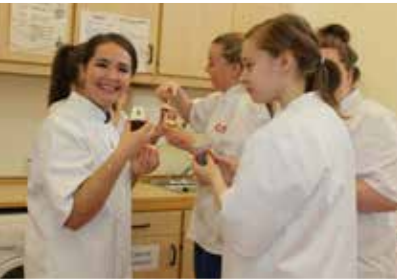
McMillan Coffee Morning