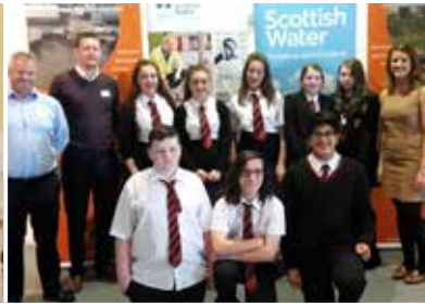
Scottish Water Project