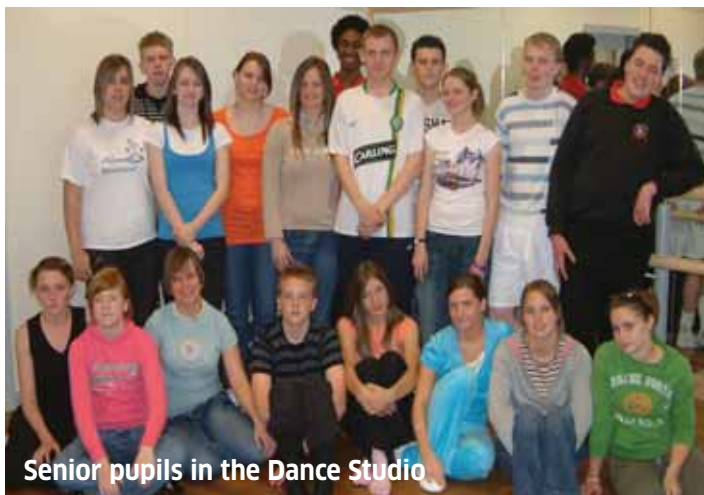
Senior pupils in the Dance Studio

'FUNDING FROM THE PROGRAMME HAS BEEN USED TO SUPPORT OUR SENIOR AND JUNIOR DANCE GROUPS'