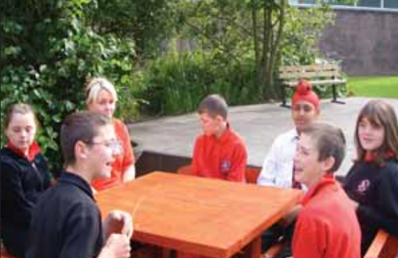
A benchmark job - page 03