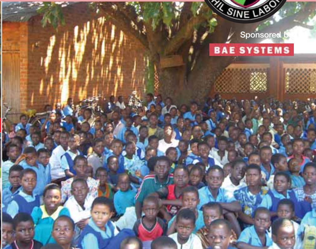
Malawi funds - full story page 07