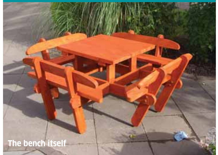
The bench itself