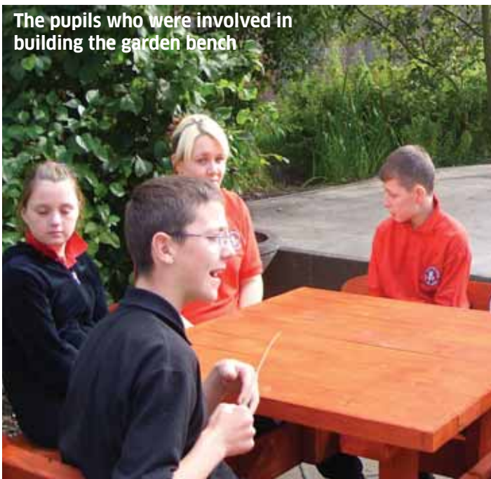
The pupils who were involved in building the garden bench

'OUR FOURTH AND FIFTH YEAR LEAVERS HAVE RECEIVED ADDITIONAL ADVICE FROM CAREERS ADVISERS FROM CAREERS SCOTLAND'