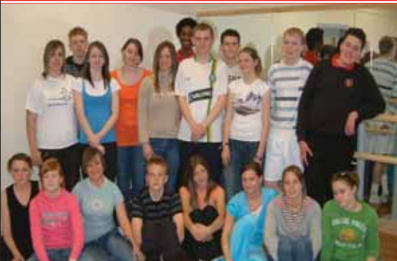
New Dance Studio - page 02