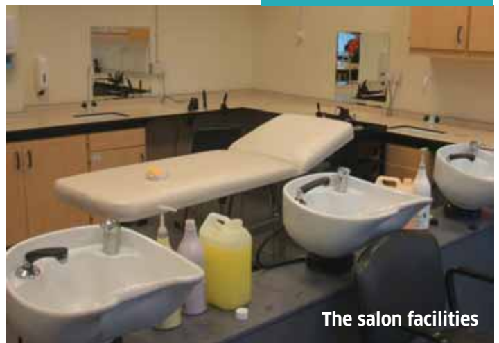
The salon facilities