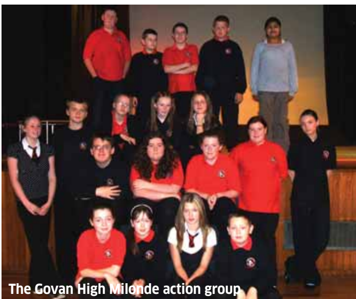
The Govan High Milonde action group

OUR partnership with Milonde CDSS, Malawi is going from strength to strength following our exchange visit last session. Already we have built global citizenship into the curriculum in many areas and this session we aim to expand on this.