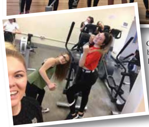
Girls fitness club have been working very hard.