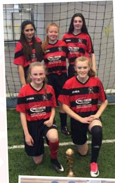
Girls football team won the Toryglen Christmas cup, as did the S1 boys Toryglen team.