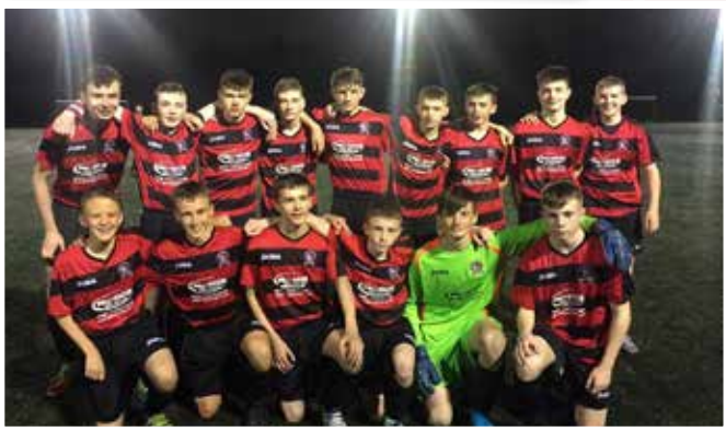
U16s football team are into round 2 of the league.