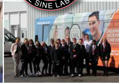
Vampire Mural Competition