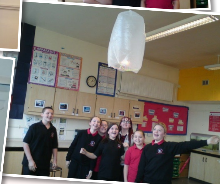
Above: The pupils made hot air balloons and set them free The balloons worked so well they reached the ceiling