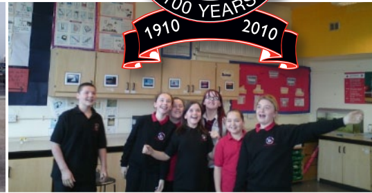
Govan High Trip to Cambridge