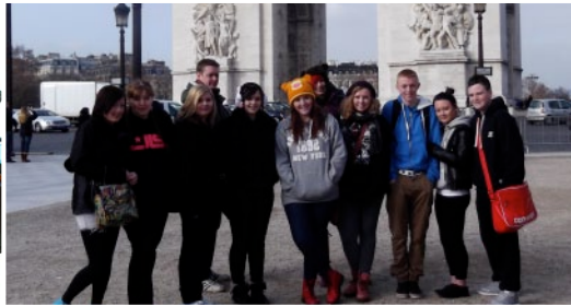
Media Class in Paris