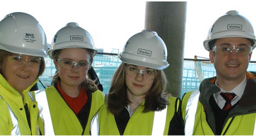
Time Capsule Project