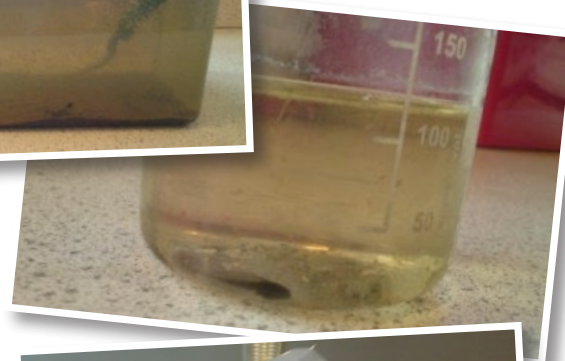
Right: The pupils collected water from the pond for the frog spawn to grow in a develop into tadpoles