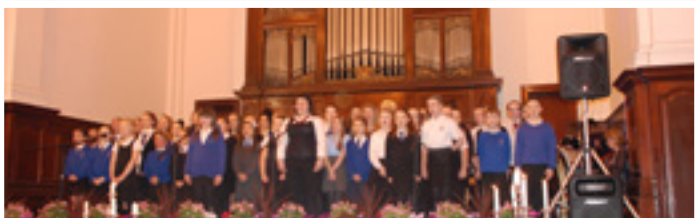
Govan High vocal group and Pirie Park Primary Choir

The "new show" in town for Govan was the Weavers' Annexation Dinner. The new show in town for Scottish education is Curriculum for Excellence . As far as our pupils are concerned, they are one and the same thing. I cannot think of a better exemplification of the spirit of Curriculum for Excellence than the learning experiences enjoyed by our pupils who were involved with the Govan Weavers' Annexation Dinner.