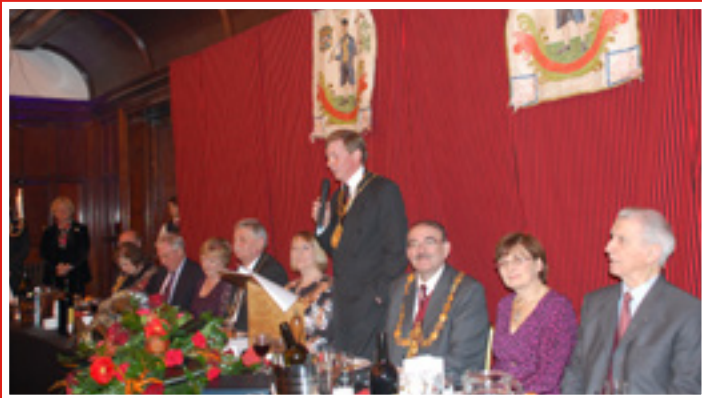
The top table