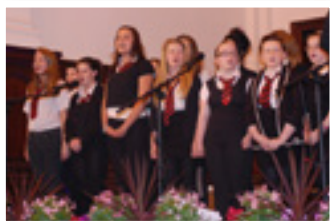
Govan High School Choir