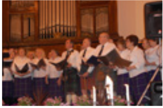
Govan Gaelic choir