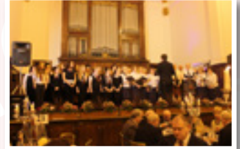
Govan High School Choir & Govan Gaelic Choir