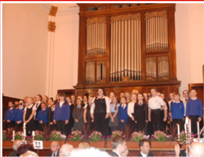
Govan High School and Pirie Park Primary Choir