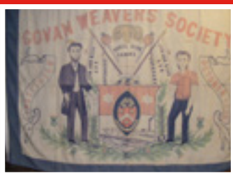
Govan Weavers banner