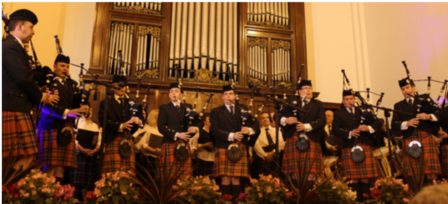
Strathclyde Police Pipe Band