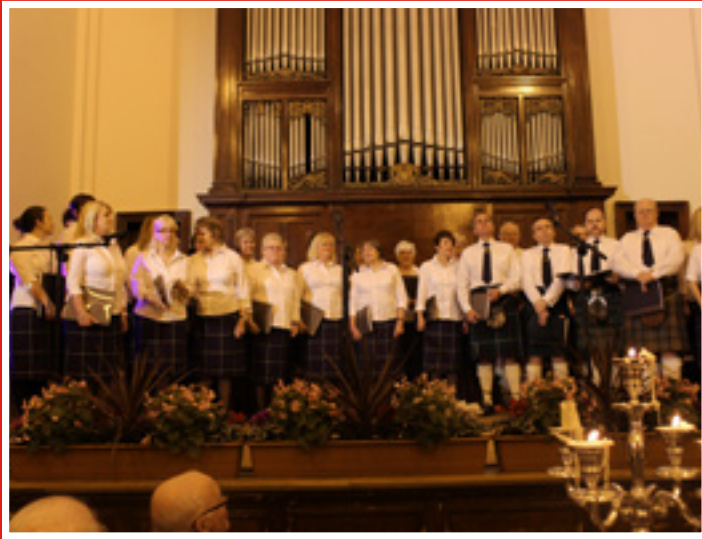
Govan Gaelic choir