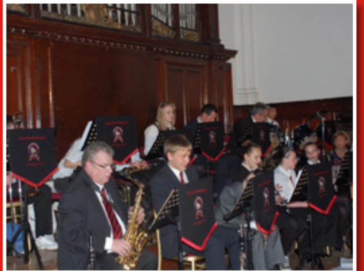
Govan High School Band