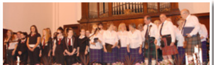
Govan High Choir and Govan Gaelic Choir