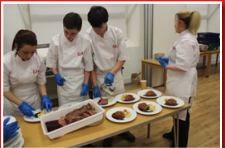
Serving the main course