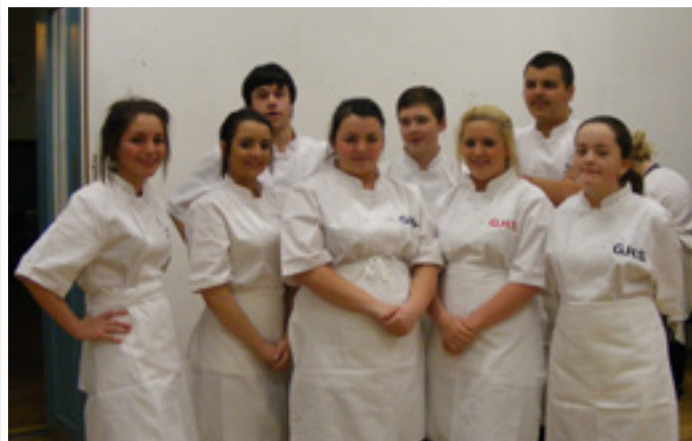
The kitchen team