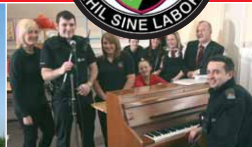
School of rock! - page 08