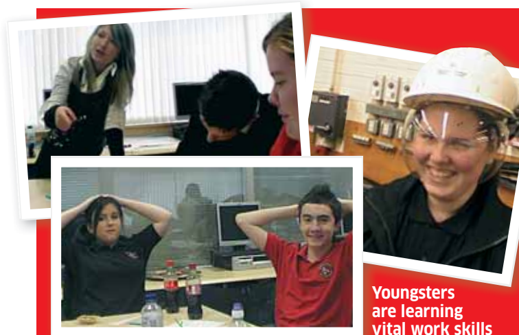
Youngsters are learning vital work skills

Inside the church is an amazing collection of early Christian carved stones. Our pupils were amazed at all the artefacts within the church and the graveyard in front of the church.