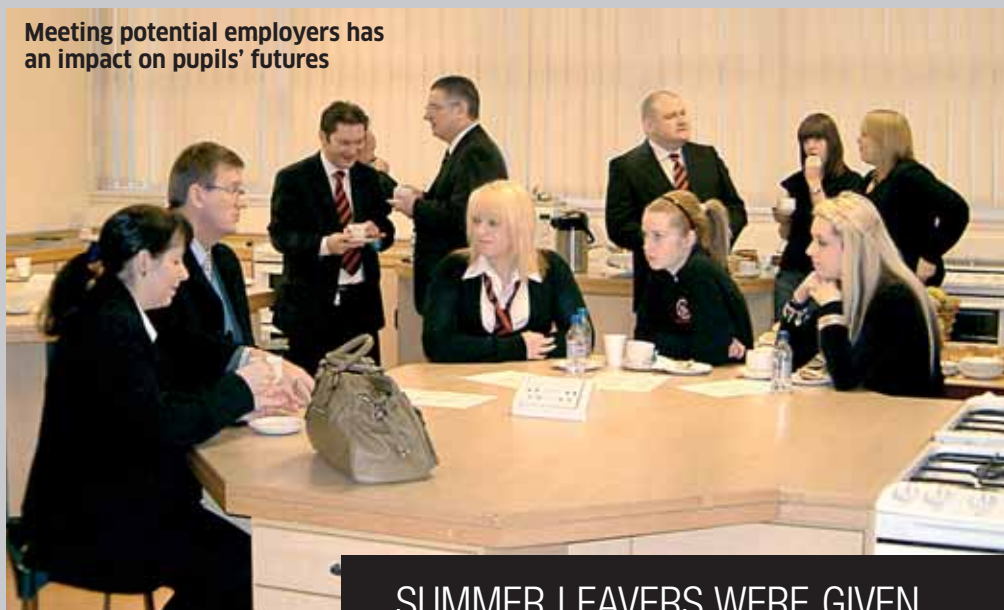
Meeting potential employers has an impact on pupils' futures