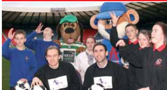
BT Vision for education - page 02