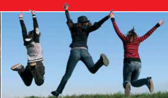
Young people's health - page 06