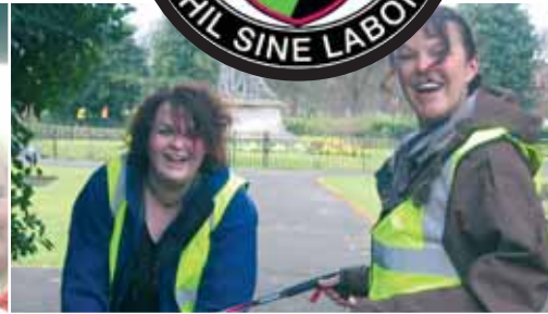
Litter gets binned - page 07