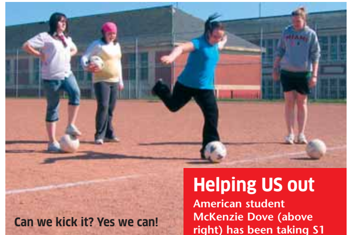
Can we kick it? Yes we can!