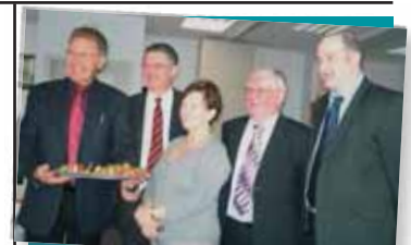
Employers enjoy breakfast

To find out more, contact the Technical Department.