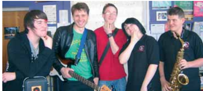
ALEX Kapranos, lead singer with Franz Ferdinand, popped in to oversee our School of Rock project with pupils recently.