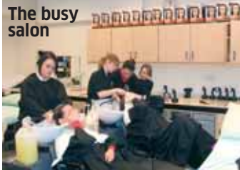
The busy salon

The former pupils all started their first day in May.