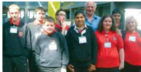
Johnny Ball with some future scientists

Johnny was presenting on maths and physics, and explained lots of interesting maths and science concepts with clarity – and plenty of jokes thrown in for good measure.