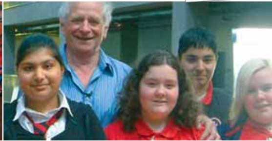
Launch event - page 06