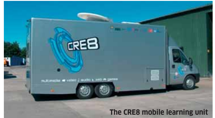
The CRE8 mobile learning unit

The project aims to reduce antisocial behaviour, crime and the fear of crime through structured activity. Kicks 'n' Tricks is a portable soccer arena and in along with with CRE8, a mobile internet learning facility, is deployed on Thursday, Friday and Saturday evenings at three local