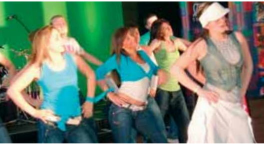
Science is fun - page 07