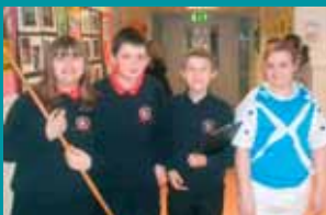
Dressed for success

GOVAN High took part in "Fashion Extravaganza", a Govan Learning Community Determined to Succeed event. The extravaganza involved pupils from other schools and nursery schools in the community.